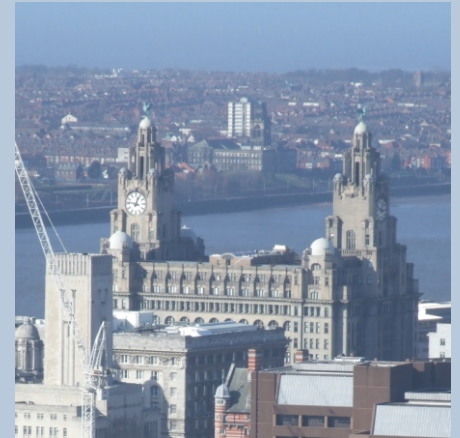
Royal Liver Building