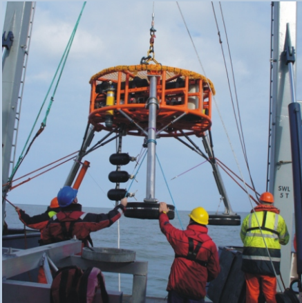
Deployment of STABLE

The 14th biennial conference will take place in Liverpool UK during the week of 25–29th August 2008